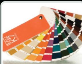
RAL K7 Guide